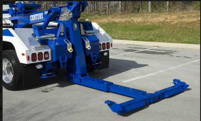
The fabricated underlift is rated at 7,000 lbs. lift capacity at its fully extended reach using lifting forks and has a tow capacity of 20,000 lbs. This makes the Century 2465 ideal for towing a wide variety of light- and medium-duty trucks, as well as automobiles.